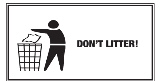
Printed on Recycled Paper

If you are interested in what the Green Team does please come to one of our meetings. We meet the 4th Thursday of the month in the court room; 3rd floor of the municipal building. Meetings start at 7:30 or immediately after the Environmental Commission meeting.